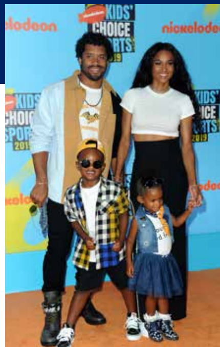
Russell Wilson with his wife, Ciara and their two children.

Last season, Wilson threw 35 touchdown passes