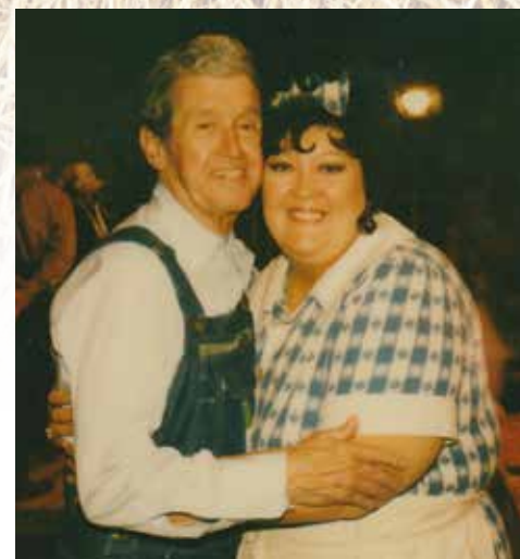
Country legend Roy Acuff was among the greats who visited "Lulu's Truck Stop," – one of "Hee Haw's" most popular regular skits.