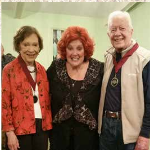
Lulu, with President Carter and his wife Rosalynn

Lulu remains eternally grateful for the program that transformed her from orphan to stardom. "The show was a wonderful time in my life because I had no family to speak of and we became kind of like a family on 'Hee Haw.' We went through marriages and divorces and deaths together—all the things life takes you through in a real family. I don't remember anytime anybody had a fight. We were there to make each other look good. Everyone involved was a great support to me when I most needed it."