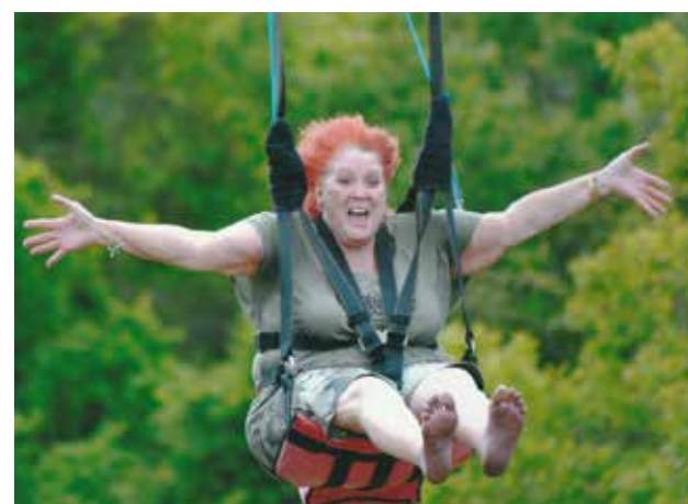
Praising the Lord as she flies high!