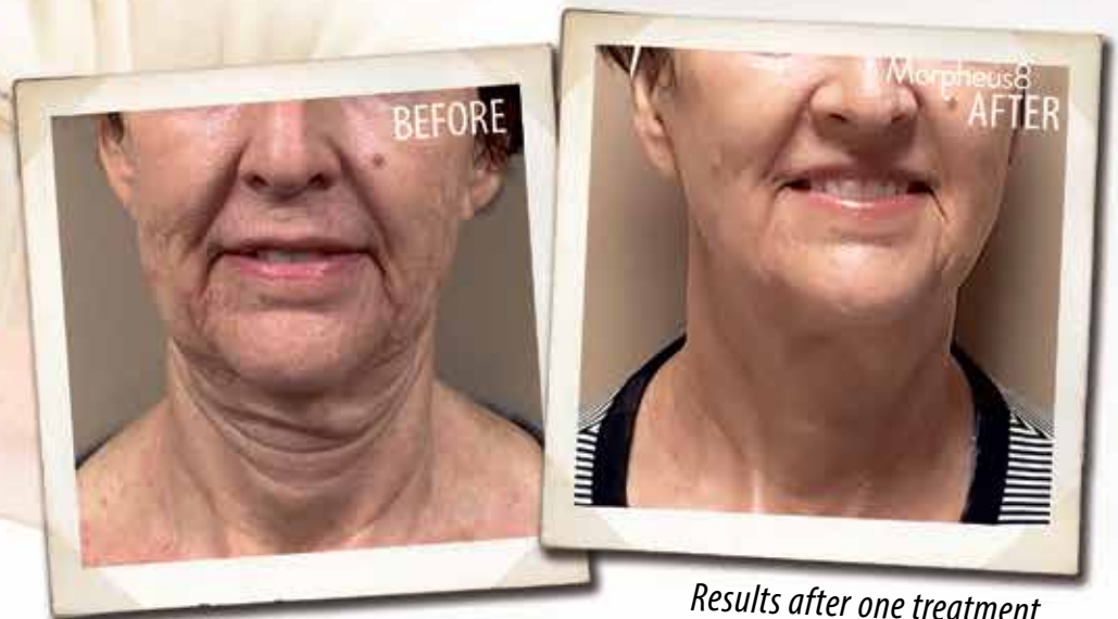
Results after one treatment

Morpheus 8 is the next generation of microneedling, combining the latest and best technology that radio frequency has to offer.