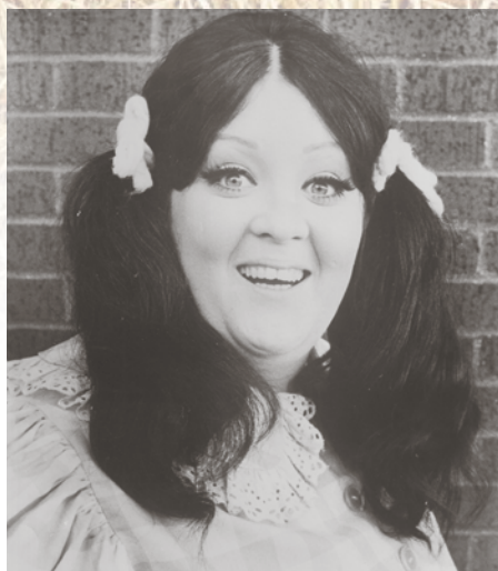
Lulu's first promo shot from the '60's.